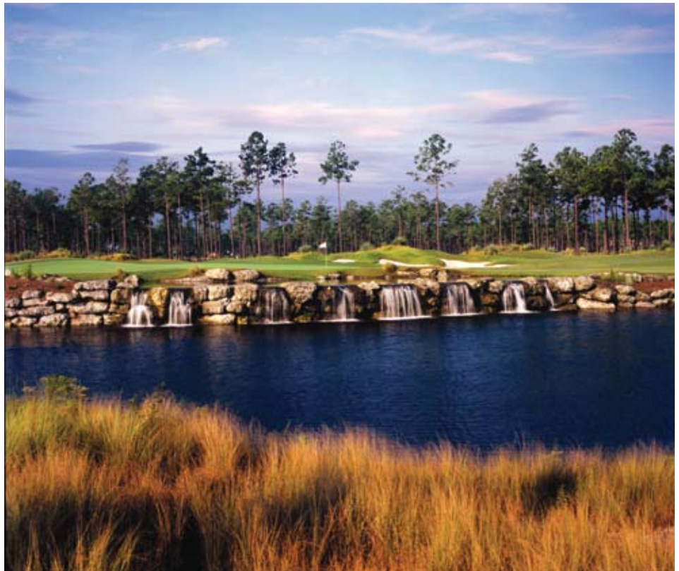
THE UNIQUE 18TH HOLE AT LEOPARD'S CHASE WITH THE WATERFALL COMING OVER THE COQUINA BOULDERS

The latest edition to the “Big Cat” collection is Leopard's Chase. Designed by renowned golf course architect and land planner Tim Cate, the layout opened in February 2007 to much fanfare. Some of the most beautiful land in the area lies within the Ocean Ridge Development and creator Cate's attention to detail in sculpting the very scenic landscape is nothing short of stunning. Spread over 220 acres of coastal terrain, Leopard's Chase features TifSport Bermuda fairways and L-93 Bentgrass greens along with beautiful scattered native grasses and plantings, preserved wetlands, large pristine pearl-white waste bunkers and dramatic elevation changes. One of the most interesting architectural touches, also featured by Cate on the Tiger's Eye Course, is the use of native coquina boulders. The most obvious use of the boulders is on the par four eighteenth hole where sixteen hundred gallons of water per minute cascade down a wall in front of an elevated green. Highlighting the front nine is the par four fifth hole with an “island” green not surrounded by water but by the beauti-