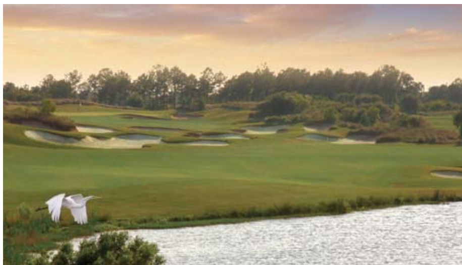
THE BEAUTIFUL FAZIO COURSE IS A GREAT SETTING FOR ANY TOURNAMENT

arrange for a shotgun start instead of having individual tee times. No handicapping will be used in scoring. Social Members may sign up for the tourney as a foursome, twosome or individually. Tournament officials will attempt to pair up non-foursomes to make a complete foursome. Only Social Members are invited to participate so that we can include as many Members as possible without taking up spots with guests. Cost is $50 per person which includes the round of golf, awards/food event following golf and prizes. The details and menu surrounding the food and awards event following golf will be announced at a later date. Reservations for the tournament are accepted on a first come, first served basis and may be made by calling the Pro Shop at 843-390-3200 by July 25, 2009, 5:00 PM. Get your foursome together early and call to sign up for our first ever Social Members Tourney.