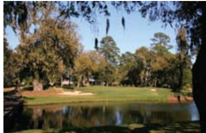
KEEPING ONE'S MIND ON GOLF AT THE HERITAGE CLUB IS DIFFICULT AS IS EVIDENCED BY THE PHOTO ABOVE

The course has been rated highly by the media including being ranked number thirty-three in Golf Digest's latest "Top 100 Public Courses in America" survey (the highest ranking of any Grand Strand Course) and was awarded 4 1/2 stars in the Golf Digest "Best Places to Play." Cost will be $50 per person. Call the Resort Pro Shop at 843-390-3200 by Monday, June 23 to reserve space. Tee times begin at 8:44 AM with double teeing. A strict 48-hour cancellation policy is in effect.