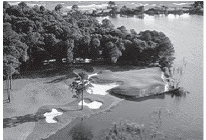
Oyster Bay #13 - Par Four

Yes, even after 25 years, Oyster Bay still remains a fresh and interesting challenge amidst a backdrop of some of the most beautiful scenery one will find in this area. To celebrate this anniversary, Keith Devos, Head Pro at Oyster Bay, is offering our members a special rate of $40 for play on February 21. Tee times begin at 7:32 am. Sign up by calling the Pro Shop at 843-390-3200 by 12:00 noon, February 19. A strict 48-hour cancellation policy is in effect.