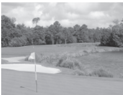
The Love Course is the setting for the Golf Magazine Championship